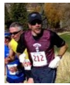
2007 Missoula's Maroon