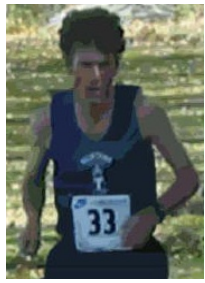
2003 Billings' old Purple